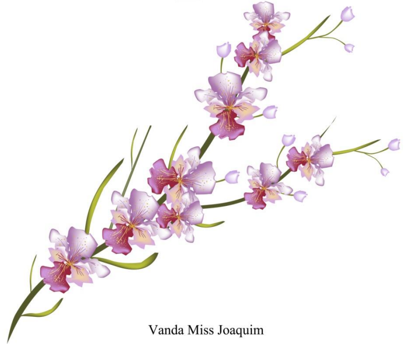
Vanda Miss Joaquim

The national flower of Singapore is Vanda Miss Joaquim.